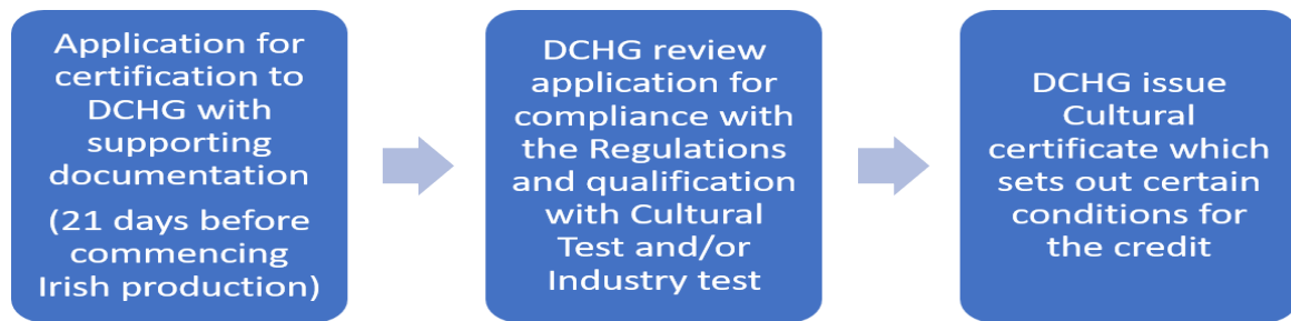
Figure 1: Film Certification Process