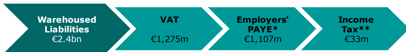
Debt Warehousing Table 1: Amounts Warehoused (at end June 2021)

*Includes approx. €398m PRSI; **Includes approx. €5m PRSI.