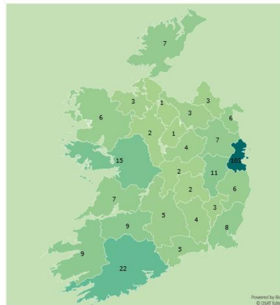
EWSS Subsidy by Employer County (€m)