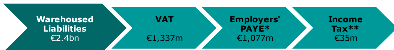
Debt Warehousing Table 1: Amounts Warehoused (at end May 2021)

*Includes approx. €391m PRSI; **Includes approx. €5m PRSI.