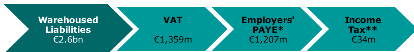
Debt Warehousing Table 1: Amounts Warehoused (at end July 2021)

*Includes approx. €431m PRSI; **Includes approx. €5m PRSI.