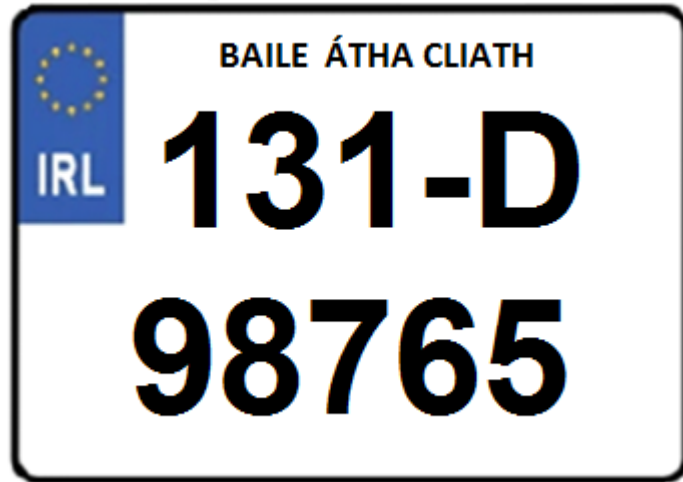
Diagram No. 4] 19

[2B. The identification mark of an eligible vehicle may be displayed on a rectangular plate which shall correspond with either Diagram No. 5 or Diagram No. 6 shown below: