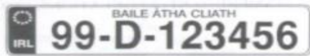
Diagram No. 1