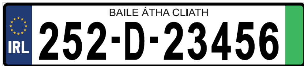
Diagram No. 5

[2B. The identification mark of an eligible vehicle may be displayed on a rectangular plate which shall correspond with either Diagram No. 5 or Diagram No. 6 shown below: