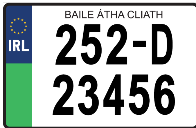
Diagram No. 6] 46