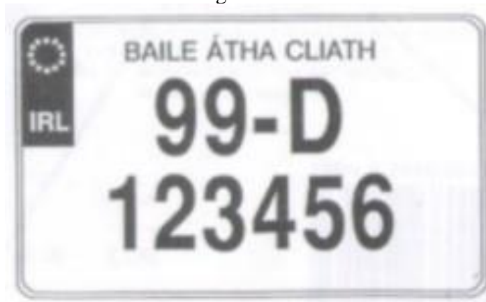
Diagram No. 2