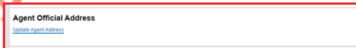
Figure 3 ROS Agents Address changes via the Profile Tab

ROS Agents/Advisors, who are Administrators, can update their “Agent Address” details via their profile tab by clicking on “Agent Official Address” under the Security Questions section.