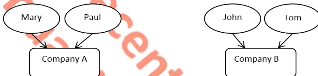
Figure 1: Before the share for share exchange