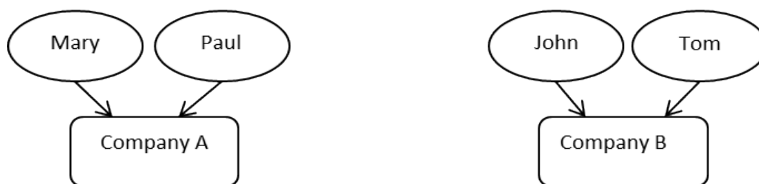
Figure 1: Before the share for share exchange