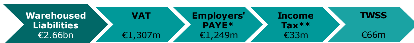
Debt Warehousing Table 1: Amounts Warehoused (at end August 2021)

*Includes approx. €446m PRSI; **Includes approx. €5m PRSI.